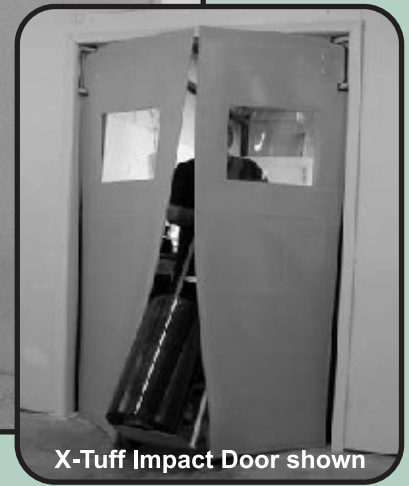
X-Tuff Impact Door shown