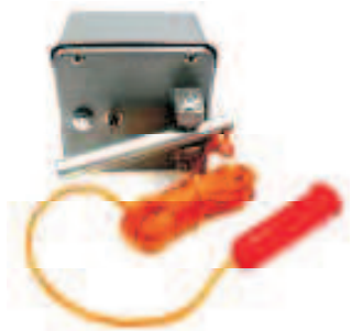
Pull Cord Pivoting cam to accommodate angle of pull.