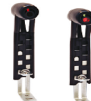
Nema 4 Photo Eye Optimal for commercial and industrial settings, flexible highly design resistant to impact.