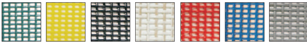
Hunter Green Yellow Black Tan Red Blue Grey

Screen • High strength vinyl coated polyester 17 x 11 weave screen.