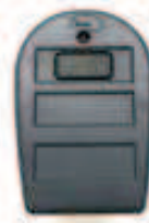
Remote Control Single button transmitter for operation of one door. Comes with L.E.D. battery life indicator.