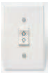
Constant Contact Switch A single pole, double throw rocker switch