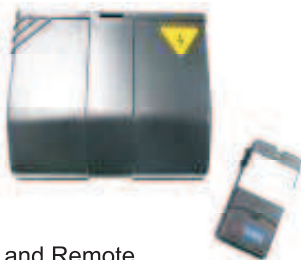
RC200 and Remote Transmit over 300 feet. Run timer with automatic shut off. Radio control remote with sequence controlled switching available in 2 and 4 channel.