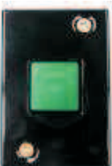
Single Button / Single Pole Switch Used in conjunction with the RC200 and remote for wall activation.