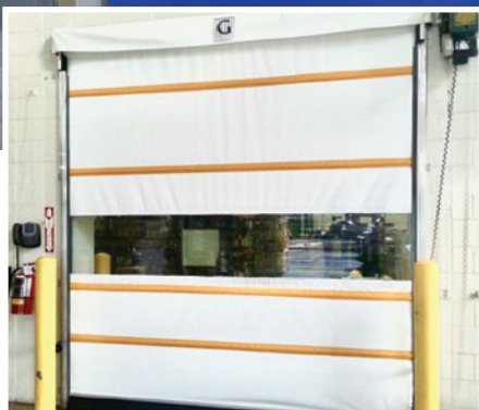
Wall Mount HC20