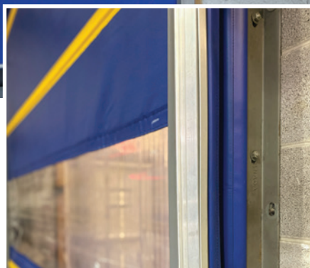
Automatic E-Track (Side View)