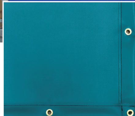
Fixed Vinyl Panel